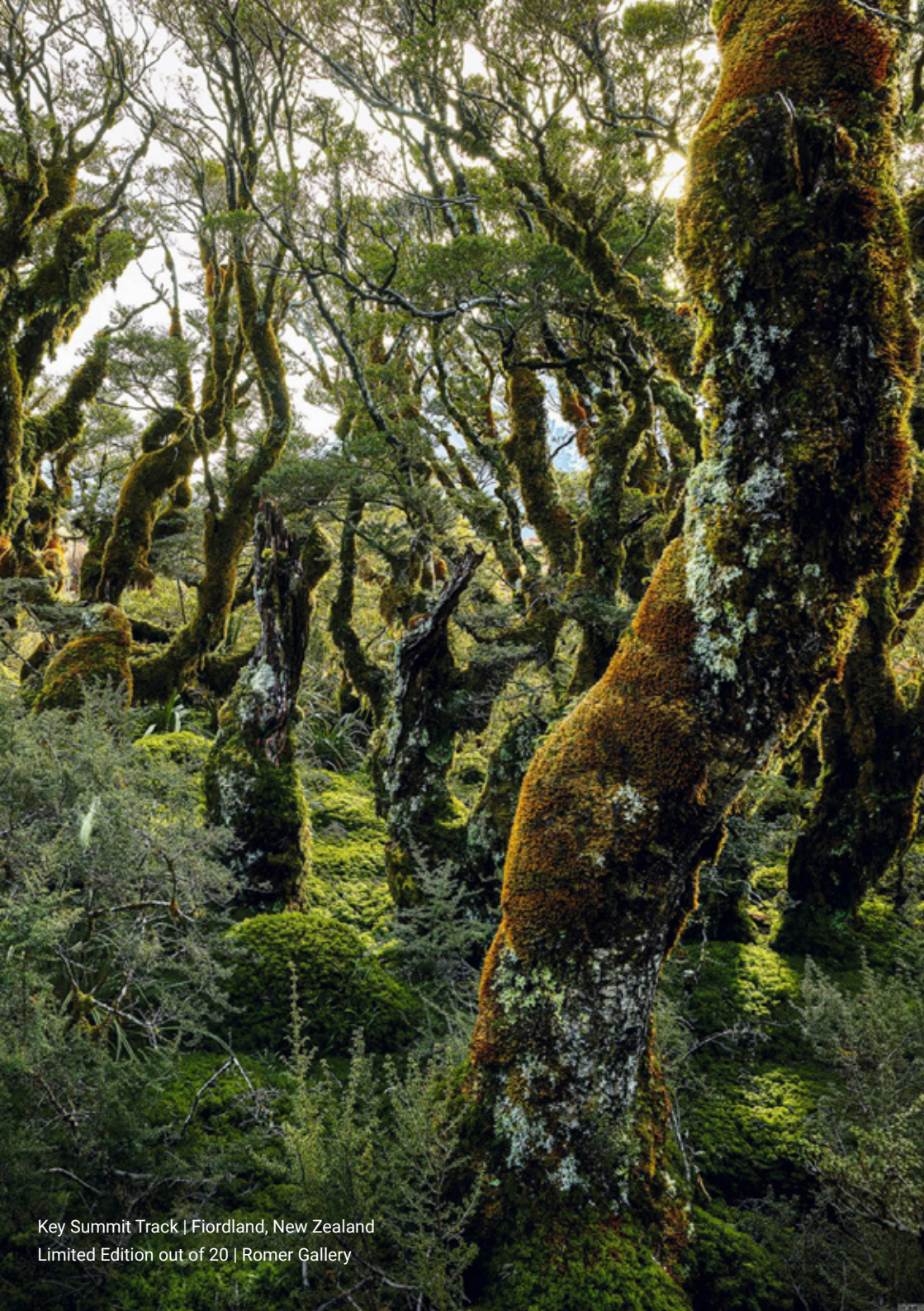
Key Summit Track | Fiordland, New Zealand Limited Edition out of 20 | Romer Gallery